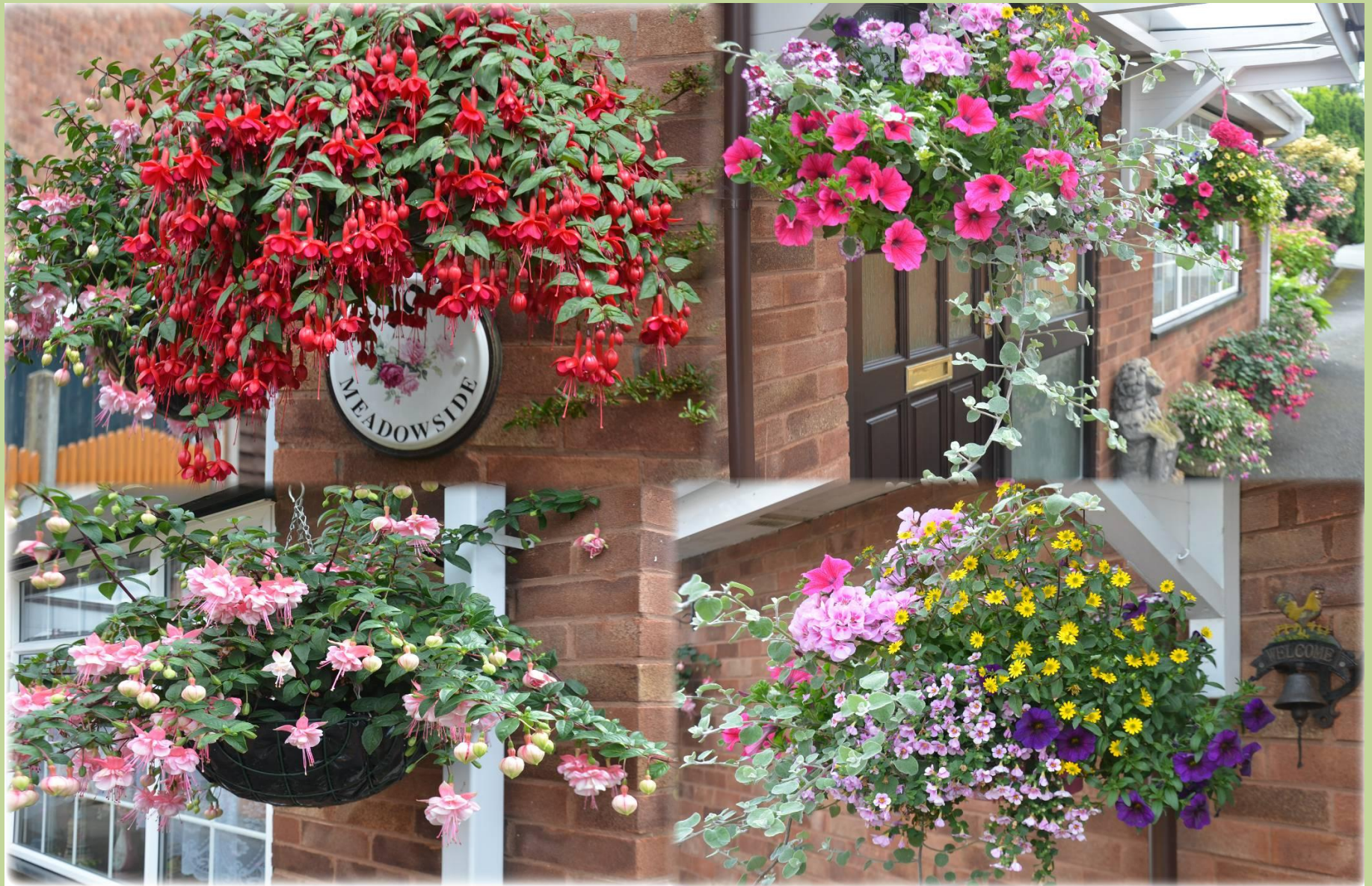
Highly Commended Hanging Baskets - 2016